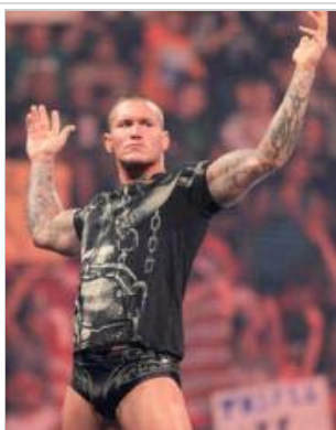
Orton's push a "failed project."

In their first encounter in March 2008, at World Class Championship Wrestling's "WrestleWar" pay per view, Austin took Lesnar to the limit - literally like no man had ever done before. Austin, in many eyes even had the Lesnar pinned following his Lights, Camera, Action! finishing manoeuvre, but the referee was down and unable to make the count. Following miscommunication between the referee and Austin, Lesnar was able to nail "The Superstar" with the F-5 and retain his championship. However, Lesnar knew full well how much of a threat Austin truly presented to his reign atop the NWA.