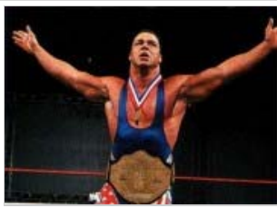
Angle enters the ring as NWA World Heavyweight Champion.